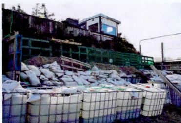
Our family home protected by sandbags

I respectfully urge An Coimisiún Pleanála to approve the application without delay.